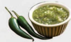
Green Chilli Sauce